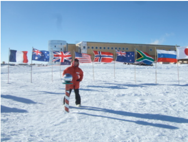
Fig. 7: The Ceremonial South Pole with flags of the 12 original signatory nations of the Antarctic Treaty.

Like the Moon, Antarctica is not owned by any nation, making it a unique common property with a model of peaceful uses among different nations. The Antarctic Treaty, signed in 1959, has been governing the activities of its 45 member nations. This was used as the model for the Outer Space Treaty in 1967, which governs the activities on the Moon as well. Currently, the International Polar Year 2007-2009 is generating many partnerships between nations. These efforts are worth studying in promoting international cooperation for the Moon. For instance, the International Lunar Observatory Association aims to establish a multifunctional facility on the Moon through multinational effort [5]. To build collaborative relationships from early on in the careers of future leaders, students and young professionals have founded the Lunar Explorers Society, an international group promoting exchanges and cooperation across boundaries. These endeavors could carry on, and try to improve, the model of cooperation established in Antarctica.