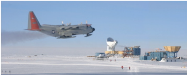
Fig. 4: Ski-equipped LC-130 aircraft taking off from the South Pole Station, with an array of observatories in the background.

and the Pole are on ski-equipped LC-130 propeller aircraft, whose hydraulic fluid for landing gear is rated for temperatures of -50\text{ C} or above. This prohibits any flights in and out of the South Pole Station from mid-February to the end of October. The limited accessibility requires careful planning of all the necessary items and contingencies.