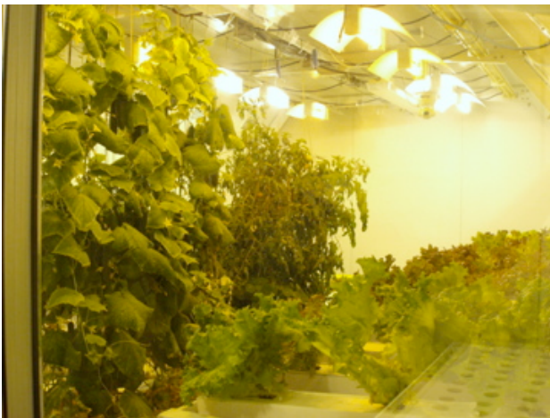
Fig. 5: The hydroponics growth chamber at the South Pole Station.

Other than the Sun light and the ground, there exist no natural resources, making it crucial to conserve as much as possible. There is a comprehensive recycling system and all the waste is brought back to the main land. To provide fresh vegetables during the long dark winter, an experimental growth chamber exists to grow crops such as cucumbers, lettuce, tomatoes, zucchinis, and herbs.