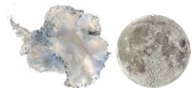
Fig. 1: Antarctica and the Moon, in roughly the same scale.

sighted until the 1820s [1]. It is a continent roughly 4000 km across, comparable to the Moon's 3500-km diameter (Fig. 1).