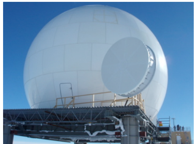
Fig. 6: Antennas for communications through relay satellites in geosynchronous orbits.

wobbled off of their original orbits enough to be visible from the Pole for several hours a day. Together, they provide \sim 12 hours a day of data link, allowing \sim 15 GB/day of data transfer at 5 MB/s as well as 5~35 KB/s internet connection. Additionally, the Iridium satellites are used to transfer electronic mail throughout the day and for emergency telephone connection. BICEP telescope transfers 3.5 GB of data to California every day.