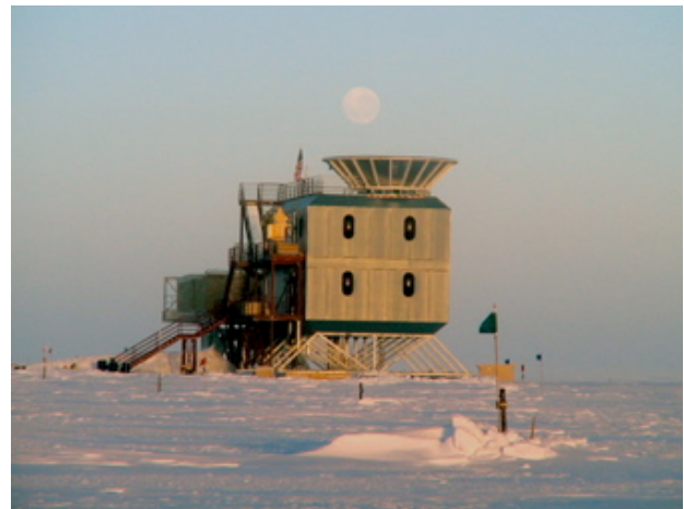
Fig. 2: BICEP observatory at the South Pole

The author has had the privilege of working at the South Pole for 2-3 months at a time during every Antarctic summers since 2005.