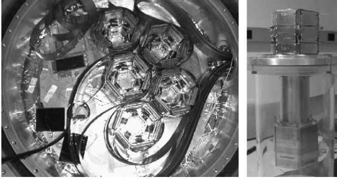
Fig. 3. (Right) A CDMS tower. The lower part of the copper cylinder is a stack of six detectors. The upper part is the housing for the readout cables. These Nb/Ti wires are heat sunk to 600, 50 and 10 mK. (Left) The CDMS-II five towers after installation in the Soudan underground refrigerator.

cryogenic checkout against any electrical continuity failure, before being delivered to the Soudan underground refrigerator lab to be installed for the WIMP search experiment.